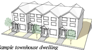
Sample townhouse dwelling

single-family dwelling at least two stories in height that is attached to at least one other single-family dwelling at least two stories in height by an unpenetrated vertical wall running from ground level or below ground level to at least the top of the highest floor designed for human occupancy, and that has a pedestrian entrance leading directly from the ground floor of the dwelling unit to a street fronting the lot on which the dwelling unit is located. Individual townhouse dwellings may be located on separate lots, or a group of two or more townhouse dwellings may be located on a single lot.