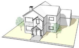
Sample single family detached dwelling

DWELLING, SINGLE-FAMILY DETACHED: A dwelling unit, located on a separate lot or tract that has no physical attachment to any other building containing a dwelling unit located on any other lot or tract, and that does not meet the definition of a manufactured home.