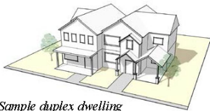
Sample duplex dwelling

A single building containing two dwelling units, each of which shares a common unpierced wall that extends from ground to roof and that totally separates the enclosed living areas within the dwelling units or the enclosed area within attached accessory garages.