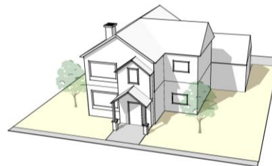
Sample single family detached dwelling

DWELLING, SINGLE FAMILY DETACHED: A dwelling unit, located on a separate lot or tract that has no physical attachment to any other building containing a dwelling unit located on any other lot or tract, and that does not meet the definition of a manufactured home.