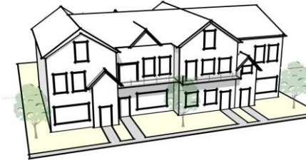
Sample fourplex dwelling

DWELLING, FOURPLEX: A single structure, located on a single lot, containing four dwelling units, none of which meets the definition of a townhouse dwelling unit or an accessory dwelling unit.