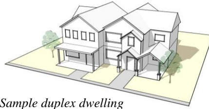
Sample duplex dwelling

DWELLING, FOURPLEX: A single structure, located on a single lot, containing four dwelling units, none of which meets the definition of a townhouse dwelling unit or an accessory dwelling unit.