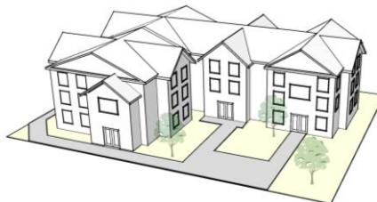
Sample multiple family dwelling

DWELLING, MULTIPLE FAMILY: Five or more dwelling units, within a single building and located on a single lot, including apartments and condominiums. This definition also includes any number of dwelling units located within a single building that contains a non-residential primary use on the ground floor of the building, and that does not meet the definition of employee housing.