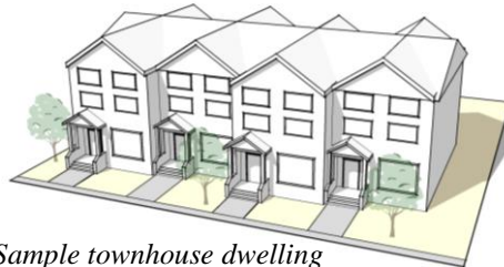
Sample townhouse dwelling

DWELLING, TOWNHOUSE: A single family dwelling at least two stories in height that is attached to at least one other single family dwelling at least two stories in height by an unpenetrated vertical wall running from ground level or below ground level to at least the top of the highest floor designed for human occupancy, and that has a pedestrian entrance leading directly from the ground floor of the dwelling unit to a street fronting the lot on which the dwelling unit is located. Individual townhouse dwellings may be located on separate lots, or a group of two or more townhouse dwellings may be located on a single lot.