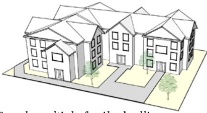
Sample multiple family dwelling

DWELLING, SINGLE-FAMILY DETACHED: A dwelling unit, located on a separate lot or tract that has no physical attachment to any other building containing a dwelling unit located on any other lot or tract, and that does not meet the definition of a manufactured home.