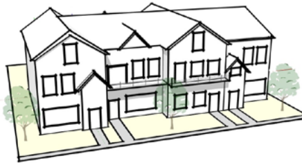
Sample fourplex dwelling

DWELLING, FOURPLEX: A single structure, located on a single lot, containing four dwelling units, none of which meets the definition of a townhouse dwelling unit or an accessory dwelling unit.