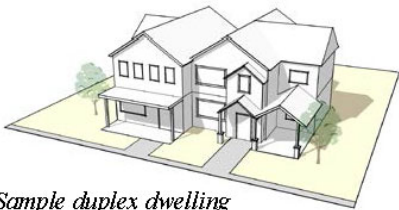
Sample duplex dwelling

DWELLING, DUPLEX: A single structure, located on a single lot, containing two dwelling units, neither of which meets the definition of a townhouse dwelling or an accessory dwelling unit.