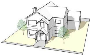
Sample single family detached dwelling

DWELLING, SINGLE-FAMILY DETACHED: A dwelling unit, located on a separate lot or tract that has no physical attachment to any other building containing a dwelling unit located on any other lot or tract, and that does not meet the definition of a manufactured home.