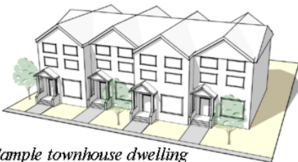
Sample townhouse dwelling

DWELLING, TOWNHOUSE: A single-family dwelling at least two stories in height that is attached to at least one other single-family dwelling at least two stories in height by an unpenetrated vertical wall running from ground level or below ground level to at least the top of the highest floor designed for human occupancy, and that has a pedestrian entrance leading directly from the ground floor of the dwelling unit to a street fronting the lot on which the dwelling unit is located. Individual townhouse dwellings may be located on separate lots, or a group of two or more townhouse dwellings may be located on a single lot.