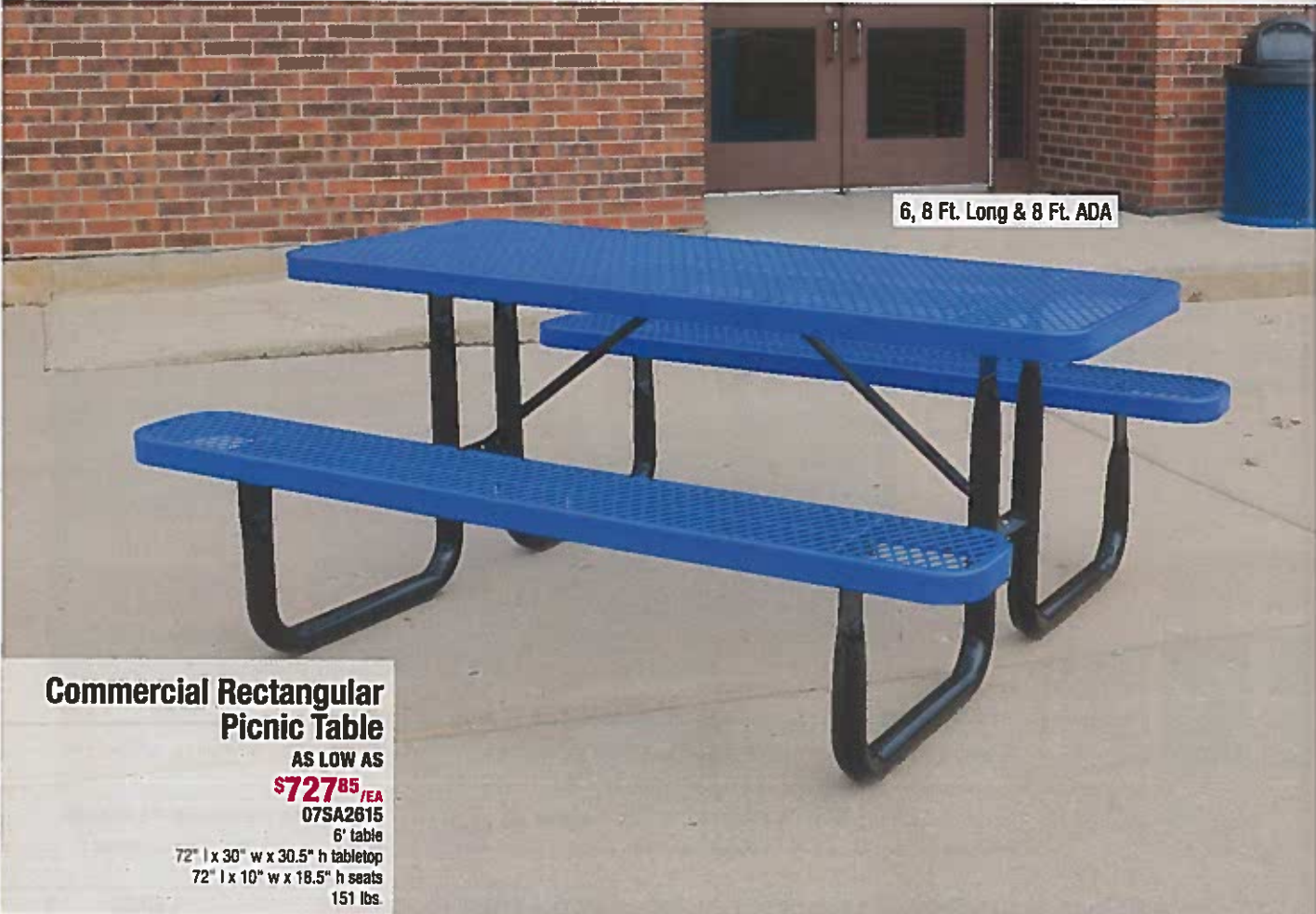
6, 8 Ft. Long & 8 Ft. ADA