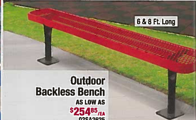
6 & 8 Ft. Long