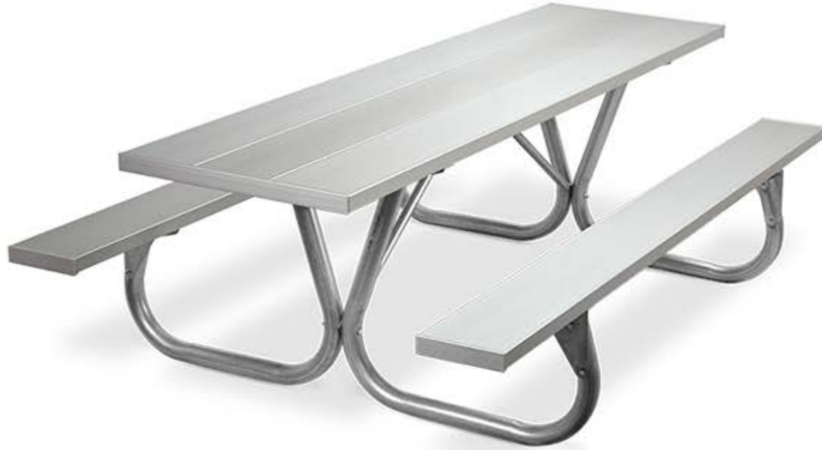
Model PC-8AA | Anodized Aluminum