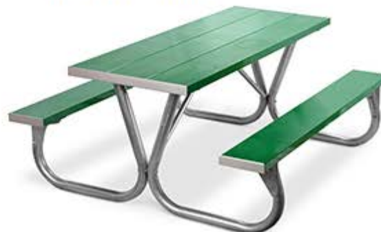
Closeout Model PC-6AG-CO | Kelly Green

Aluminum planks can be anodized for a clear finish or powder-coated in kelly green or tan. Tables are available in 6' or 8' Lengths.