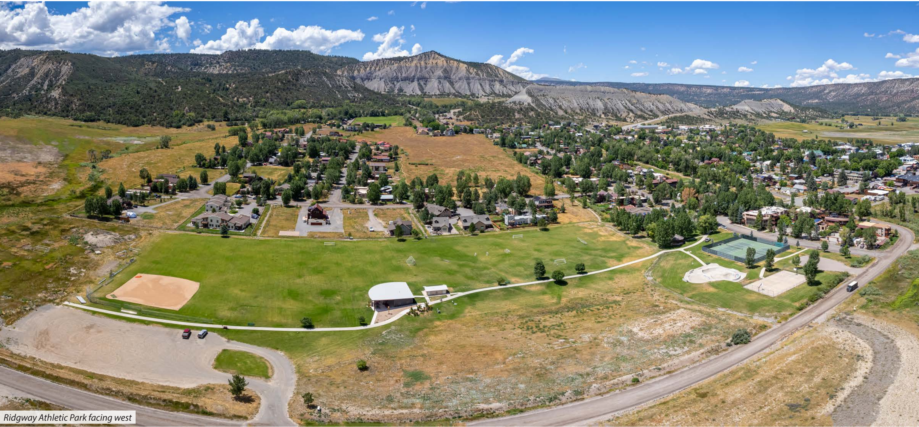
Ridgway Athletic Park facing west

The Ridgway Athletic Park Master Plan was developed by the design team through a comprehensive public process to act as a guide for the future development of the Athletic Park. This document features information on existing conditions, a preferred concept plan, community engagement and background, as well as funding opportunities and a preliminary opinion of probable costs. The final preferred master plan design focuses on athletic uses for the park, while also maintaining the well-loved panoramic views and openness of the space.