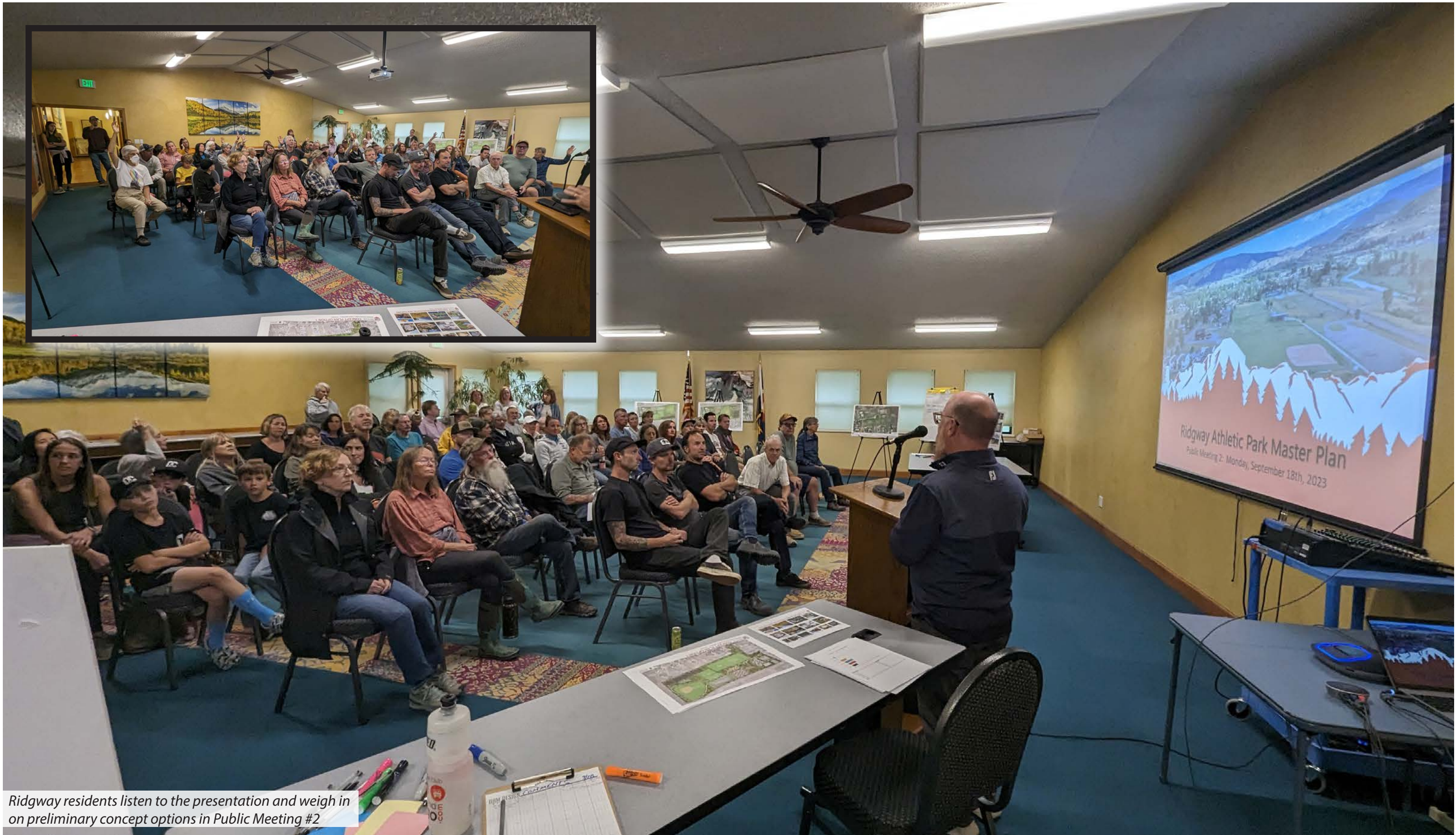
Ridgway residents listen to the presentation and weigh in on preliminary concept options in Public Meeting #2