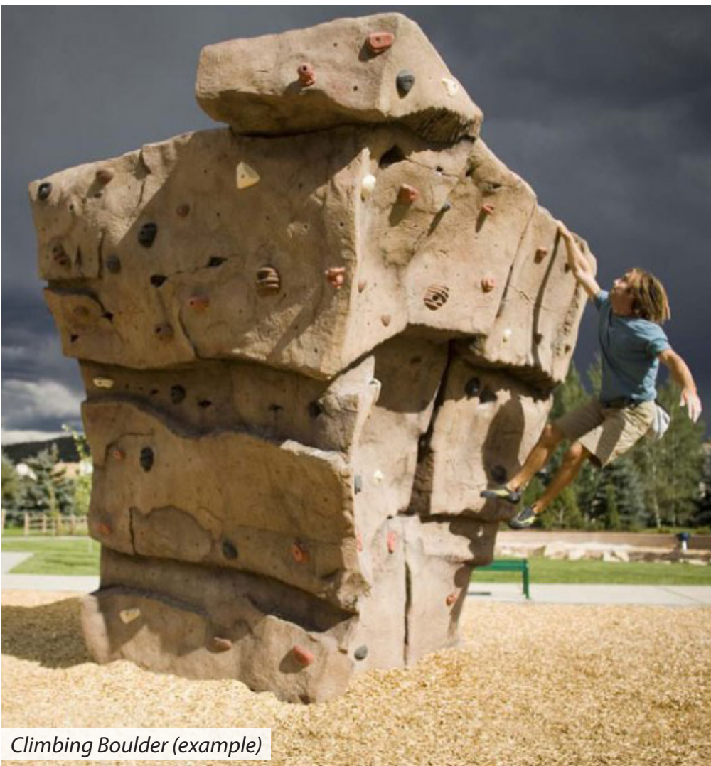
Climbing Boulder (example)

Playground with Climbing Boulder – The Athletic Park features many different sports fields and courts for older children and adults—necessitating the inclusion of a small play structure for younger-aged kids. A demonstration climbing boulder is also featured alongside the playground in the central location by the restroom as both would require safety surfacing beneath them. The play structure would be small in scale and would showcase two structures: one for children aged two through five and one for children aged five through twelve. A small swing set may also be included in the layout. The playground could be designed to be more rustic or nature-focused to match with the nearby demonstration climbing boulder; or it could be bold, bright colors to attract kids’ attention. The climbing boulder could be natural or sculpted concrete and would be sized so that even adults could practice. Handholds may be natural or sculpted into the boulder or could be colorful and mounted. There are many different potential color schemes and layouts that the playground and climbing boulder could take on; however, there is consensus gleaned from the public process that both of these features are desired and needed at the Athletic Park. The location of them in close proximity to the restroom and central to other activities was also desired by the community.