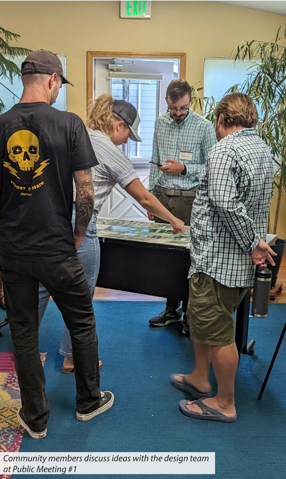
Community members discuss ideas with the design team at Public Meeting #1

The input from this comprehensive public process ultimately resulted in the final preferred master plan shown in this document that the Town of Ridgway can use as a guide for implementation as funding is acquired.