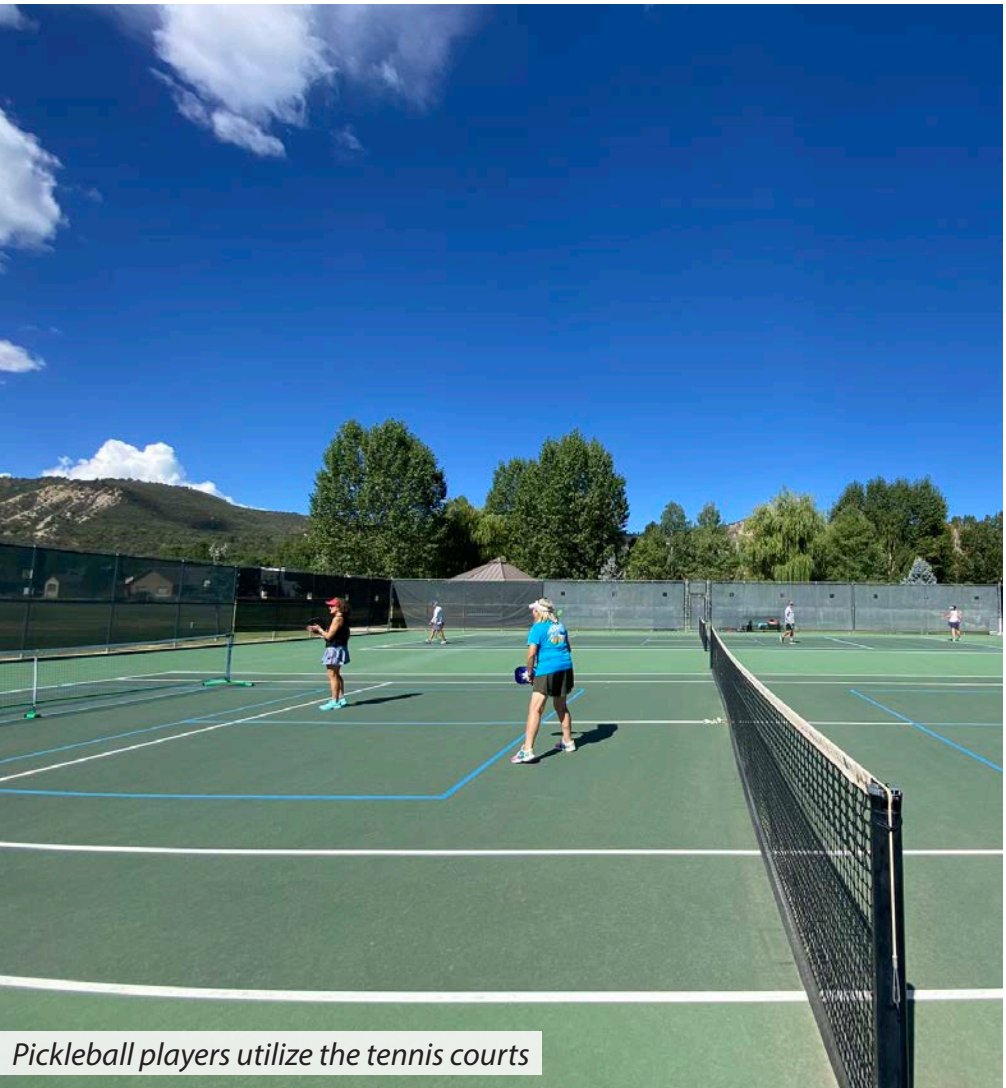
Pickleball players utilize the tennis courts

As the park development moves forward from a master plan level, layouts and materials may change and cost estimates will need to be updated.