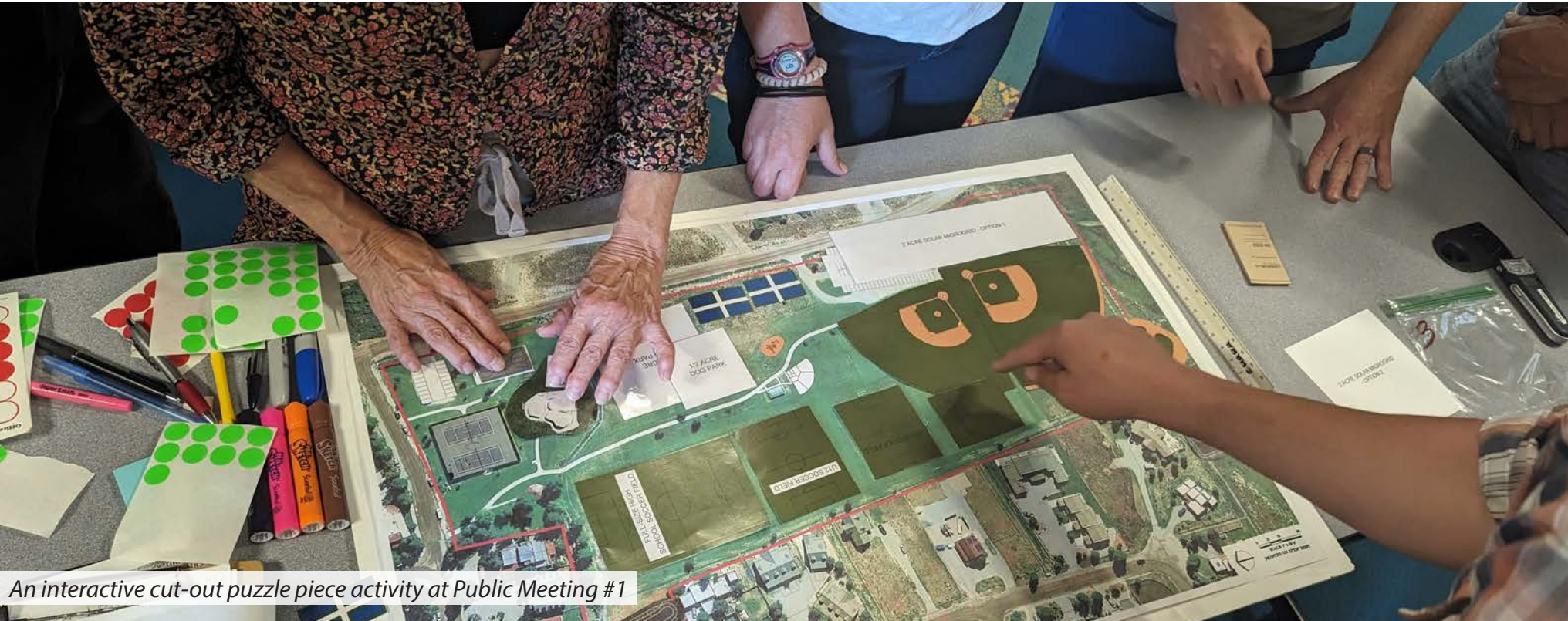
An interactive cut-out puzzle piece activity at Public Meeting #1

The first public meeting took place on Thursday, August 3rd in Town Hall. Locals gathered to see a presentation about the existing conditions and amenities and proposed future amenities at the Athletic Park as well as to learn about the purpose of the project. This was followed by an information gathering session where the large poster boards of the existing Athletic Park aerial were shown with an interactive cut-out puzzle piece activity of different proposed park amenities. Meeting attendees then had the opportunity to play around with these cut-outs to configure different park layouts for the design team to vet and develop several draft plan concepts. An online community survey was also open for the next month to receive feedback.