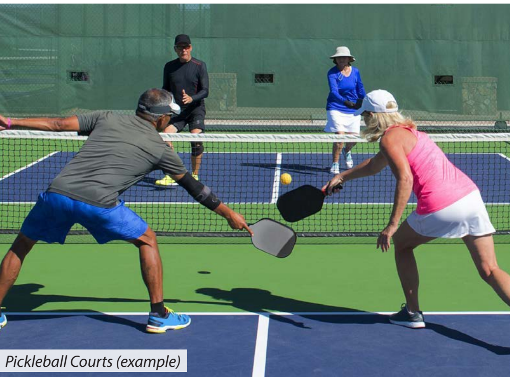
Pickleball Courts (example)

Pickleball – A new eight-court pickleball complex would be developed at the southeast area of the park close to parking, the new restroom, and the pavilion. (This location is also further from residential areas than the current multi-use tennis and basketball court location.) The pickleball complex would serve the 150+ members comprising the Ridgway Pickleball Club. The design features shaded viewing areas with benches between the courts as well as significant vegetated noise berm buffers on the north, east, and west sides of the courts to reduce sound impacts on neighboring residential areas. Future expansion for four additional pickleball courts could occur to the south of this proposed complex location if needed in the future.