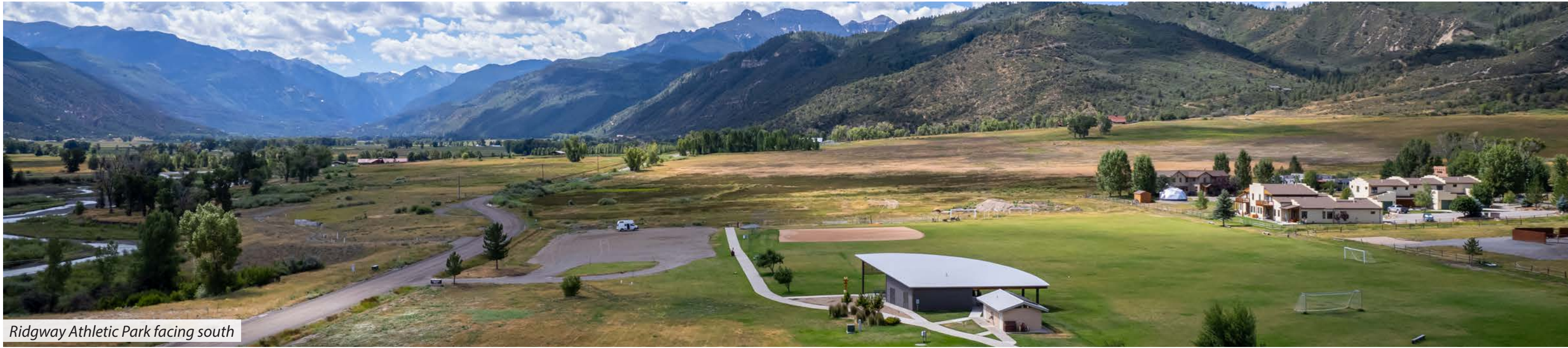
Ridgway Athletic Park facing south