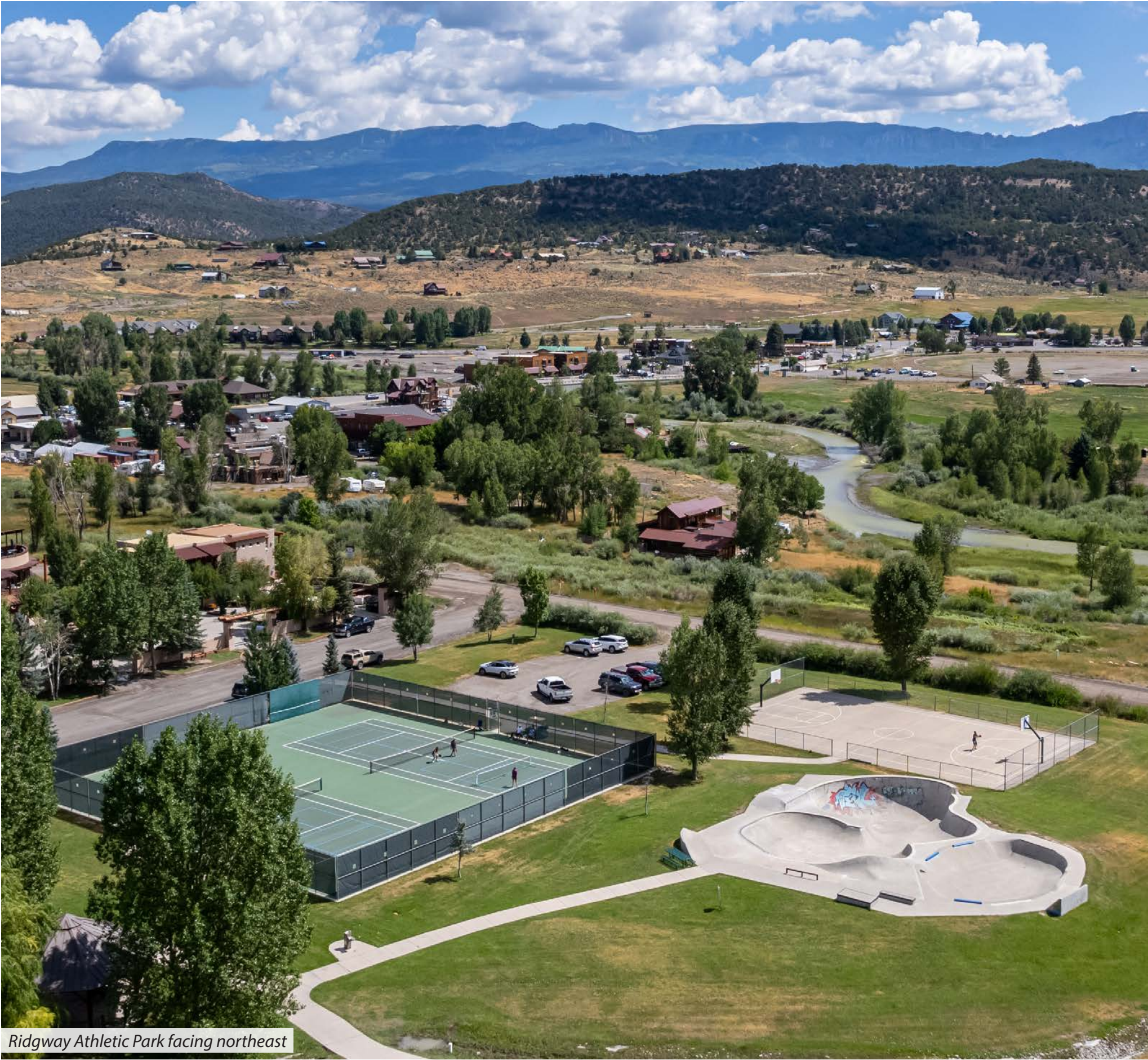
Ridgway Athletic Park facing northeast

The Ridgway Athletic Park Master Plan was developed by the design team through a comprehensive public process to act as a guide for the future development of the Athletic Park. This document features information on existing conditions, a preferred concept plan, community engagement and background, as well as funding opportunities and a preliminary opinion of probable costs. The final preferred master plan design focuses on athletic uses for the park, while also maintaining the well-loved panoramic views and openness of the space.