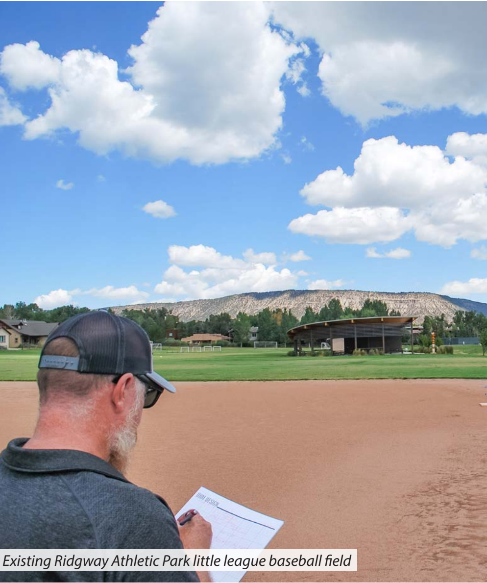
Existing Ridgway Athletic Park little league baseball field

*Note: Trails will be developed within the proposed phases to provide access to the different park features as they are built.