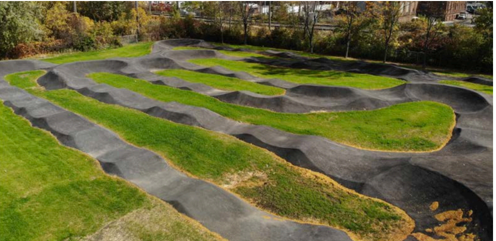
Bike Park Pump Track (example)

Bike Park – The Bike Park, which is currently leased by the Town to the Ridgway Bike Park at the southeast corner of the Athletic Park, has been relocated to a more central location in the preferred master plan concept rendering. By ensuring that the bike park and skate park amenities are in close physical proximity to each other, this design hopes to encourage the positive synergy between the two similar user groups. The bike park design, which is a professional level pump track and skills course developed by PumpTrax USA, features two entrances to the two paved loop paths. It is approximately one acre in size. In addition to the professional level pump track, a soft surface strider track is proposed to be multi-functional with the exercise equipment circuit for small children's use.