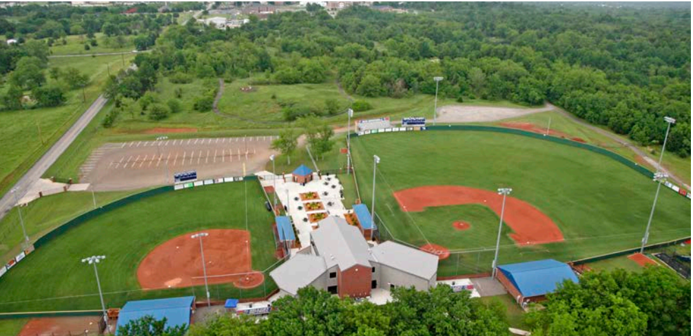
High School & Little League Baseball Fields (example)

Baseball – The Ouray County Baseball organization has 90+ participants from ages four through 14, not including softball players. This growing community can be served by the two baseball fields shown in the preferred concept plan: a full-size fenced regulation high school field with a 300 feet outfield and a softball/little league field with a 200 feet outfield. The fields are located on the southern end of the park in order to maintain the open layout at the Athletic Park. Both fields feature dugouts, bleachers, and scoreboards. A batting cage is also shown. If the baseball community continues to expand, there is an existing field available at the Elementary School that would not take too much refurbishment to develop into an additional fully functional little league field.