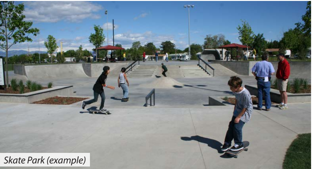
Skate Park (example)

Skate Park – The Ridgway Skate Park is located towards the northeast part of the Athletic Park and currently features a 5,000 square foot park with bowls, concrete wheel stops and benches, rails, and ramps. Some work was recently done to the existing skate park to improve safety and remove loose gravel areas. In the preferred master plan rendering, the skate park is expanded to include new a wheels park and competition features to a footprint of approximately 16,850 square feet. This addition would offer features that cater to various skill levels, sports, and riding styles. Moreover, the expansion would accommodate for small children from the age of three all the way through adulthood.